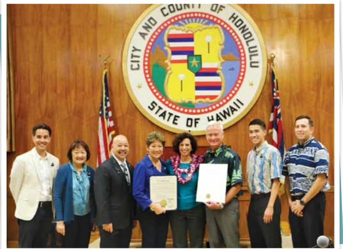
Governor David Ige, Mayor Kirk Caldwell, and the Honolulu City Council recognize SAAM 2015